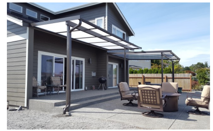
Bi-Level Shed Style