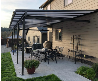
Classic Shed Style, Wall Mount