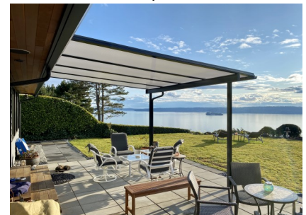
Classic Shed Style, Low Roof Mount