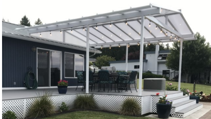
Gable Style w/ Fills, Roof Mount