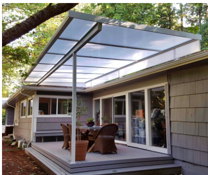
Classic Shed Style, Raised Roof Mount