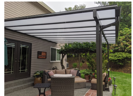
Classic Shed Style, Wall Mount