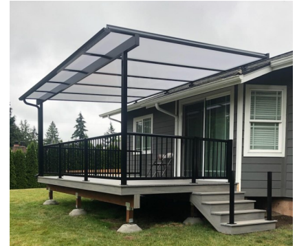
Classic Shed Style, Low Roof Mount