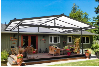
Gable Style w/ Fills, Roof Mount