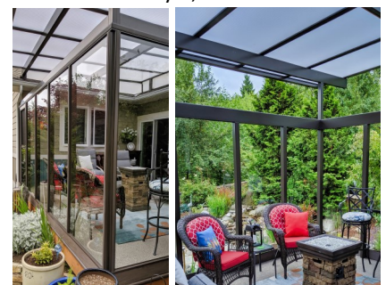
3 Season Enclosure