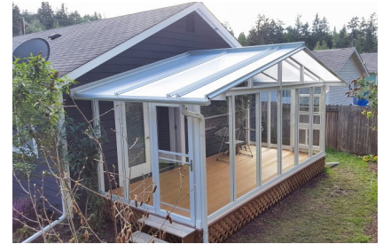
3 Season Full Enclosure